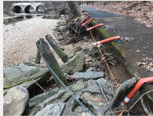
Dora Kelley Park