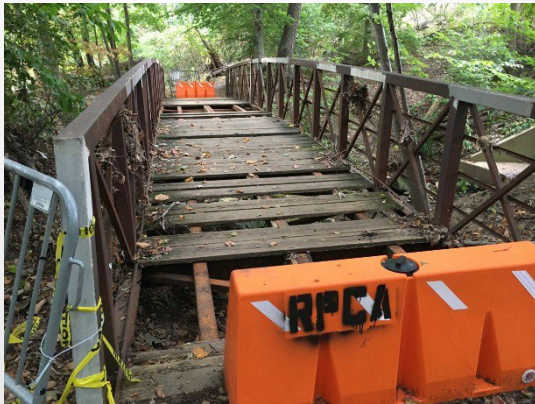
Morgan Street cul-de-sac