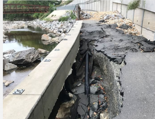
North Ripley Street