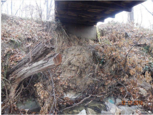
4600 Duke & Jordan Streets