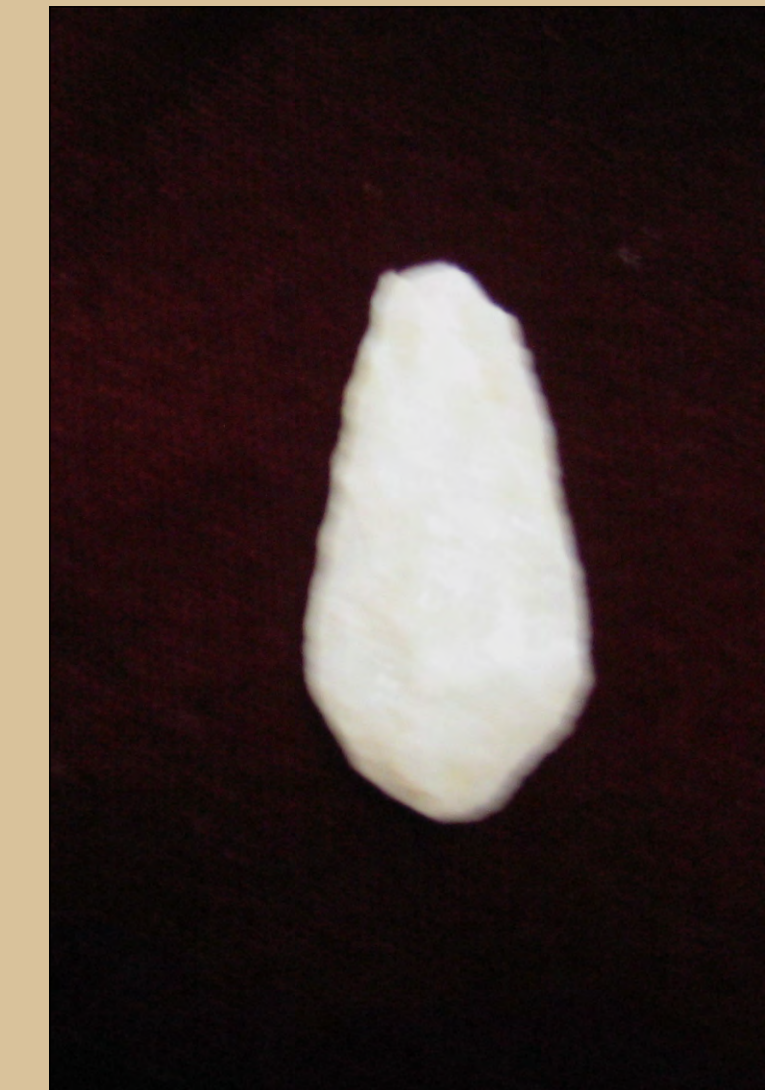
About 3000 years ago, American Indians camped by a stream, which now runs underground near here, to make stone tools. This quartz spear point was left behind. It is the oldest datable artifact discovered in two archaeological investigations.

This space honors the Bloxham family members still buried in the cemetery and all those who occupied this space for 3,000 years.