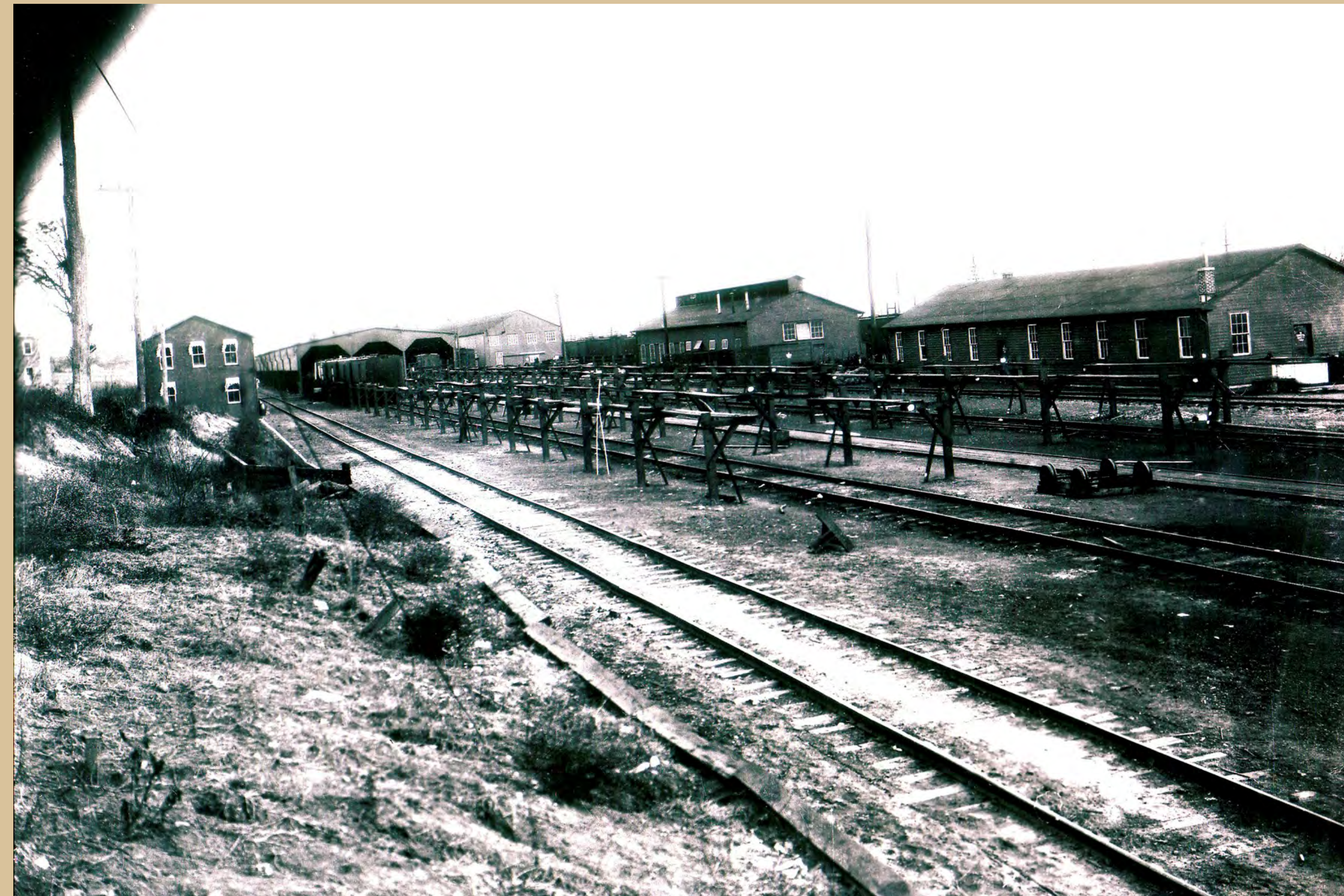
Rail sidings and machine shops for making refrigerated rail cars covered most of this recreational area from the 1920s until the 1980s. At its peak, Fruit Growers Express Company covered 30 acres and employed about 500 men.

Although buried for a decade the Bloxham Cemetery has survived many episodes of land-altering development. During construction in the 1920s, graves were discovered. Eight graves, including those of five children, were moved to Bethel Cemetery. The remaining graves were buried under deep fill soil. Archaeological investigations in the 1990s rediscovered both the cemetery and an American Indian site. In 2004, archaeologists working with the Woodrow Wilson Bridge Improvement Project completed investigations to find all the remaining graves before the City of Alexandria planned the recreational complex.