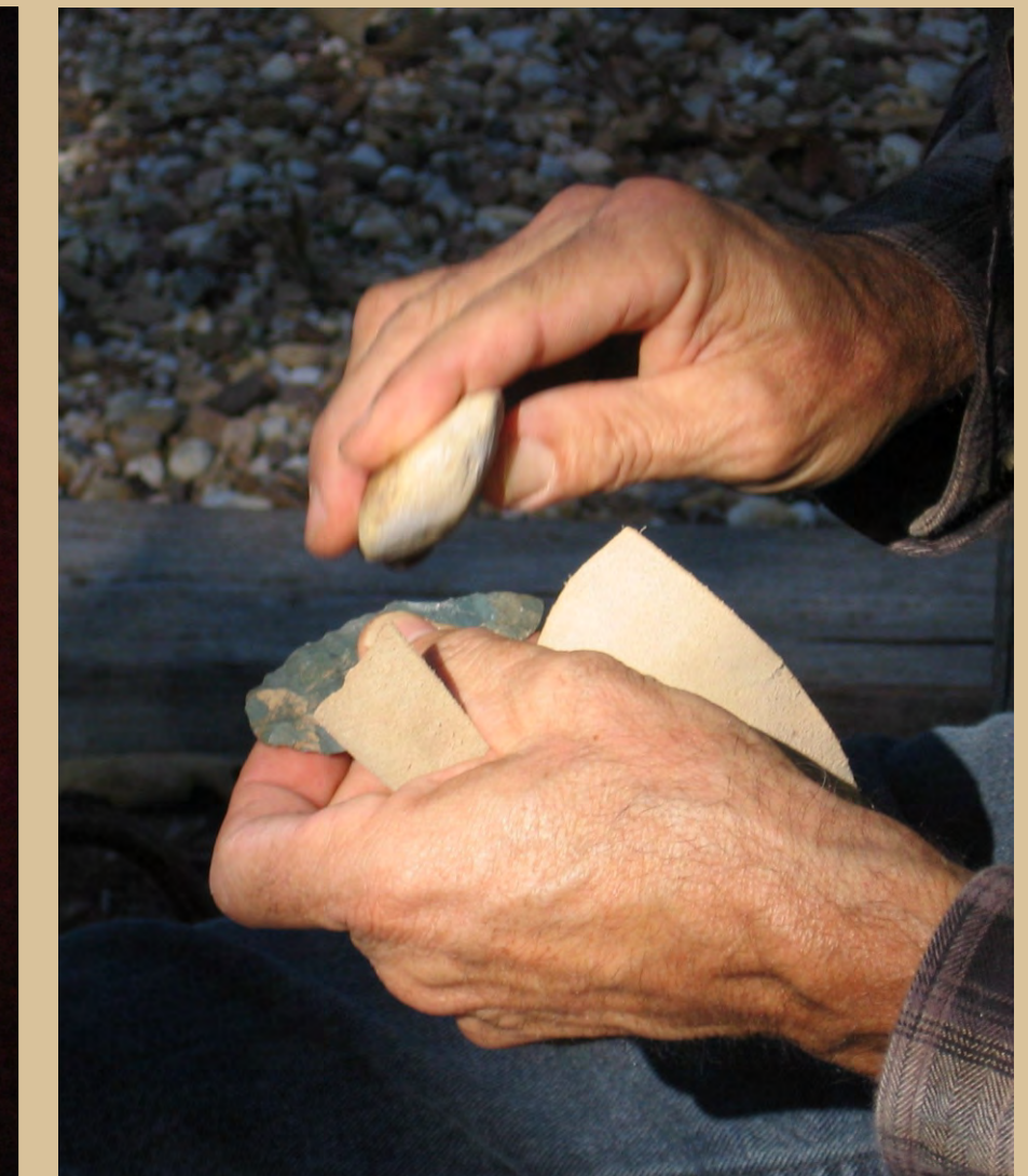
American Indians made tools by striking flakes from a cobble core with a hammerstone, a process called "flintknapping." The stone flakes recovered from archaeological excavations here demonstrated that people made tools at this site.

Produced by the City of Alexandria, Office of Historic Alexandria, Alexandria Archaeology Museum and the City of Alexandria Department of Recreation, Parks and Cultural Activities with support from the National Park Service Challenge Cost-Share Programs alexandriarchaeology.org