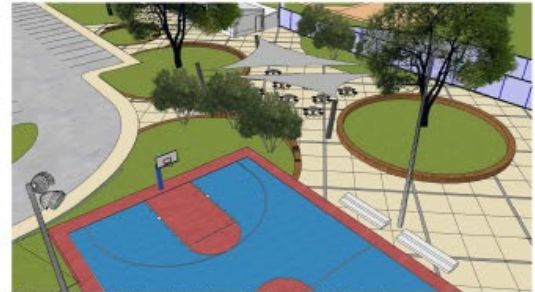
Basketball Court / Pedestrian Plaza / Seating / Shade Structure