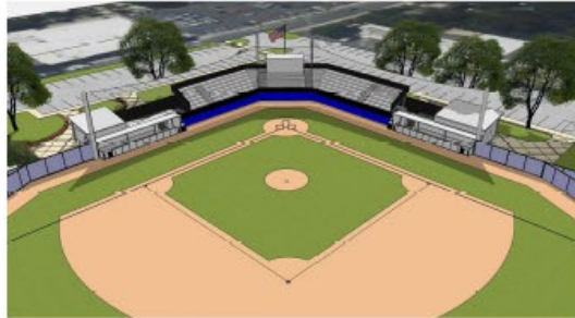
Site Improvements (View South-West)