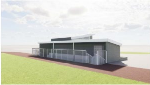
B4 DUGOUT VISUALIZATION A-2016/ 12" = 1'-0"