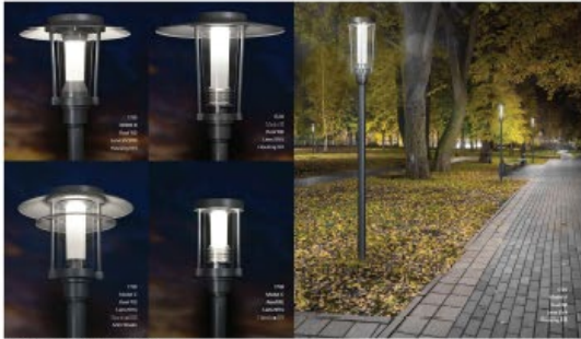
Pathway/ Plaza Lights