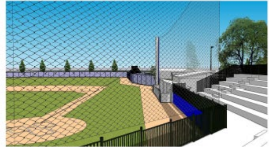
Big Simpson Bleacher