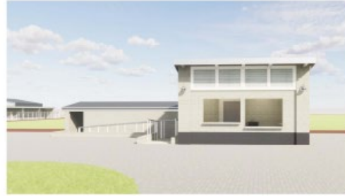
C1 CONCESSIONS VISUALIZATION A-2016/ 12" = 1'-0"