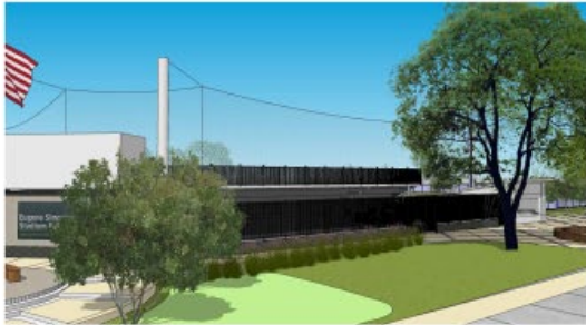
Rear Bleacher Screening