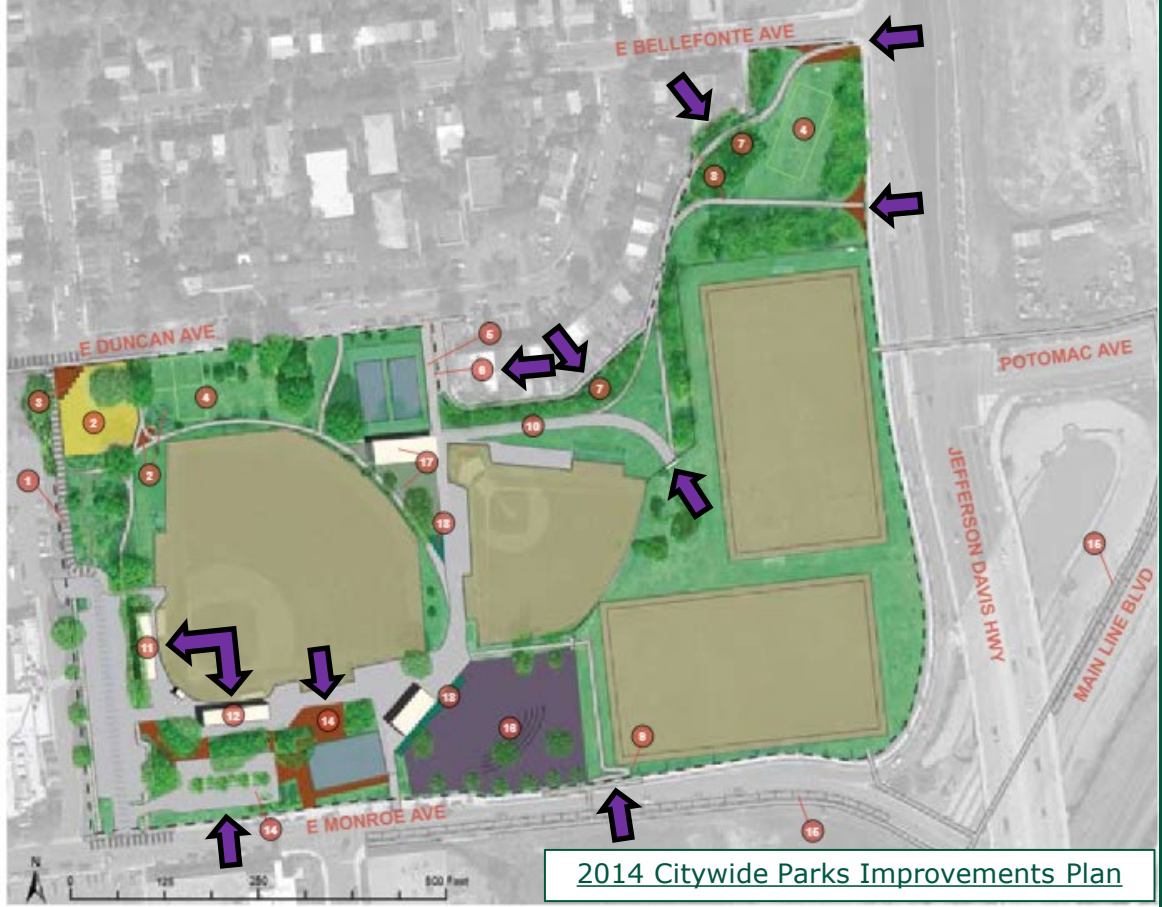
2014 Citywide Parks Improvements Plan