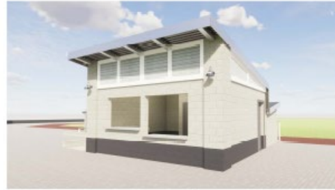
B1 CONCESSIONS VISUALIZATION A-2016/ 12" = 1'-0"