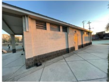
M4 CONTEXT IMAGE A-2016/ 12" = 1'-0"