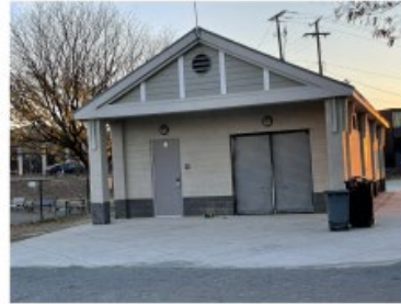
A1 CONTEXT IMAGE A-2016/ 12" = 1'-0"