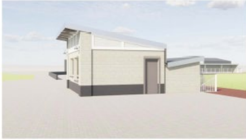
C4 CONCESSIONS VISUALIZATION A-2016/ 12" = 1'-0"