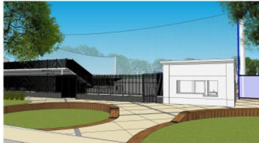
Seating / Rear Bleacher Screening