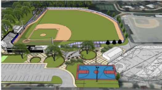
Site Improvements (View North)