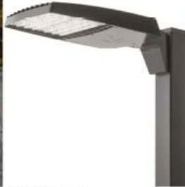
Parking Lot Lights