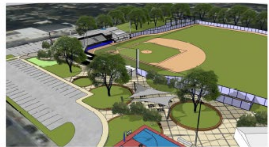
Site Improvements (View North-West)