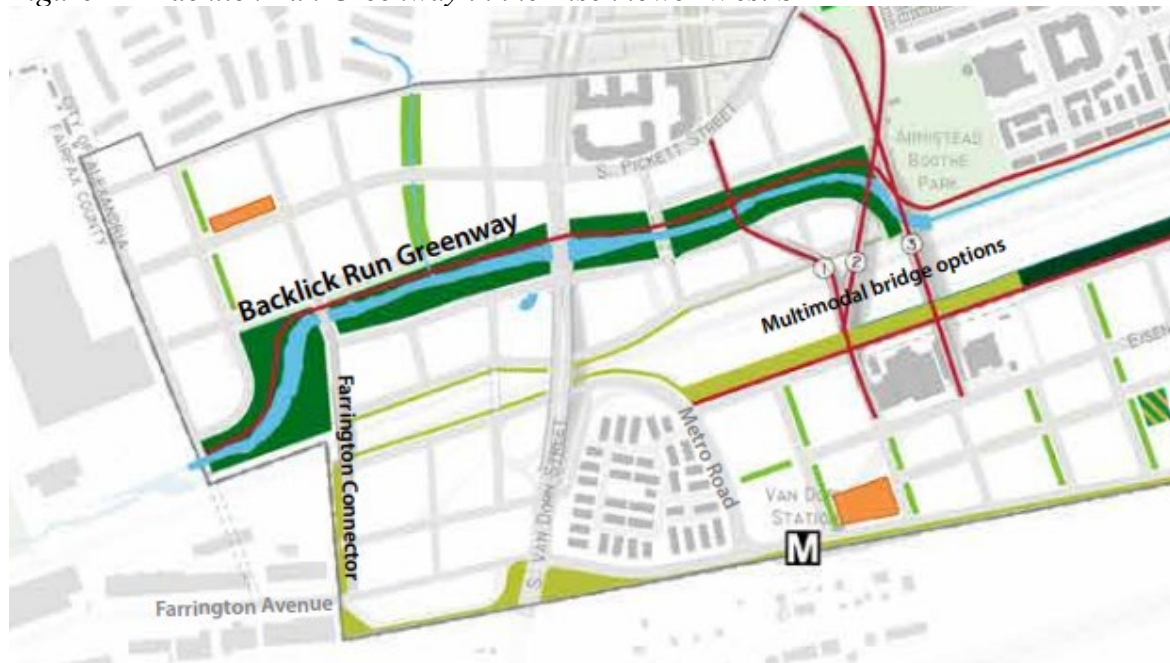
Figure 1 – Backlick Run Greenway in the Eisenhower West SAP

Since constructing the park is in-line with the Small Area Plan (SAP) recommendations, staff are proposing to allow the applicant to credit the cost of the park and the pedestrian/cyclist bridge against the expected Eisenhower West/Landmark Van Dorn Implementation Developer Contributions Policy. Since the budget will not cover the pedestrian/cyclist bridge and the entire park construction, staff requests that the Park and Recreation Commission provide guidance for the prioritization of the current and future park contributions. The park features include: