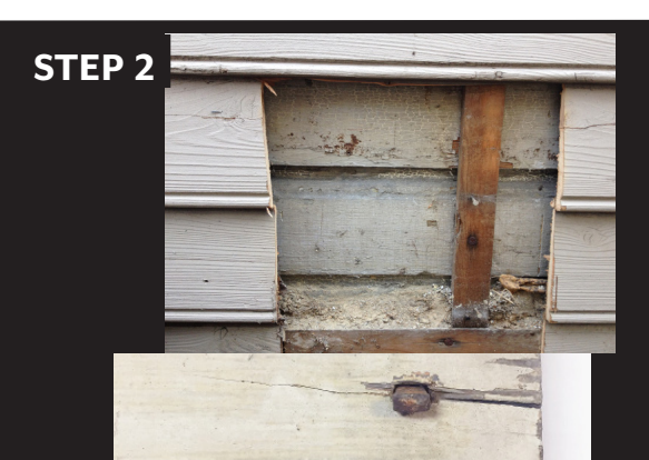
Using clues such as the siding profile and the type of nails used, Staff makes a determination on the age of the siding.