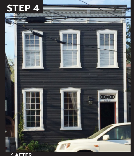
In this case, removal of the contemporary siding also revealed ghost marks in the old paint from which the originial window and door trim was able to be recreated.