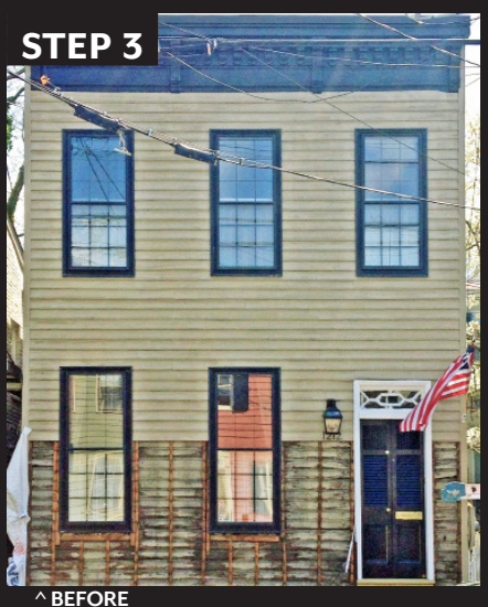
More of the historic siding is exposed for Staff to assess its condition. In this case, the historic siding is in very good condition and will be stripped and painted for reuse on this building.